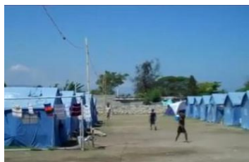
Haiti tented city

Lions Clubs in the UK and Ireland alone have raised in excess of £630,000. LCIF, working in conjunction with the UN and local Government, have funded replacement educational/health facilities including 3 tented cities and over 600 new houses for the homeless population.